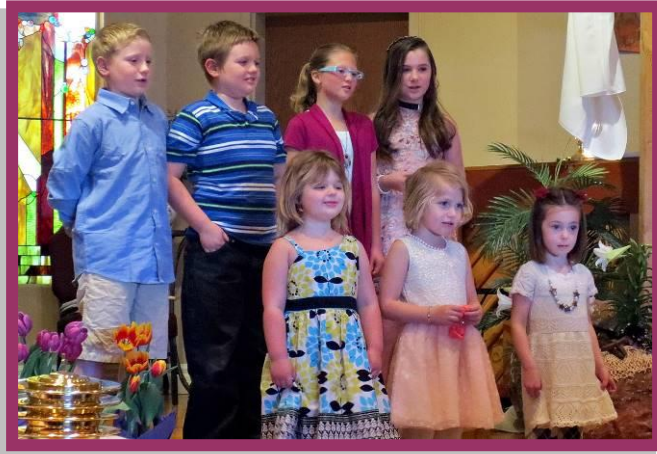
On Easter, the children presented an impromptu song for our worship service.