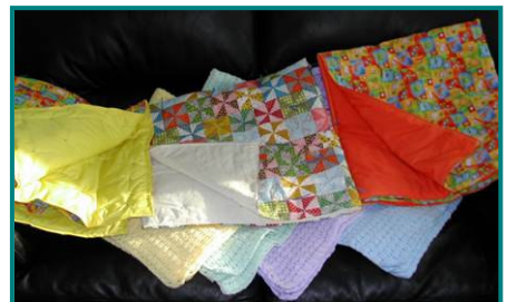
Some of the quilts...